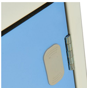
Galvanised hinges and hinge cover plates